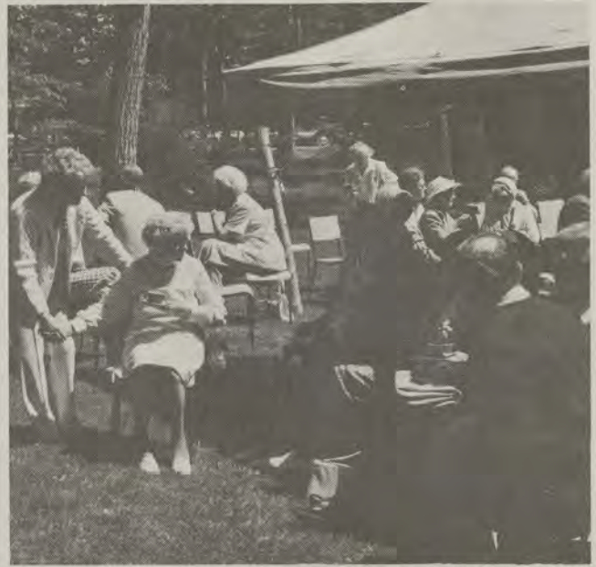
Back to Banff Day 1976

It's quite something to see two old friends who haven't laid eyes on each other for twenty or thirty years meet again. That's what often happens at Back to Banff Day , the Archives of the Canadian Rockies' tea party and round-up held annually on Father's Day. At this time it is our pleasure to play host to those who have a love for the mountains and have spent some time living in them in order that they may gather to recall old times, swap reminiscences and renew acquaintances.