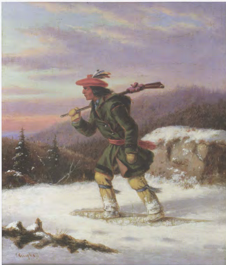
Cornelius Krieghoff, Hunter , 1878, oil on canvas, 21.9 x 26.1 cm, Whyte Museum of the Canadian Rockies