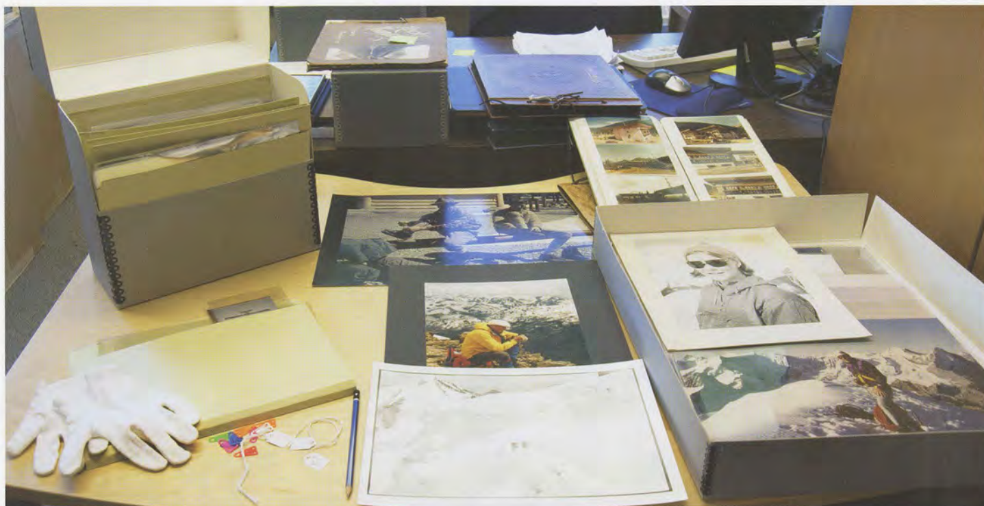
A selection of Hans Gmoser's photographic records being processed.