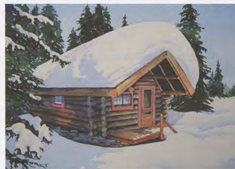
Sheila Churchill, Lakeshore Cabin at O'Hara , watercolour on paper

Good things come in small packages! A favourite tradition of locals and visitors, the Museum hosts its annual holiday season Art Show & Sale. Choose from individual works of art or handcrafted artisan made gift items. Artists have challenged their artistic boundaries by literally thinking inside the 144 square inch box to create these winter-themed treasures.