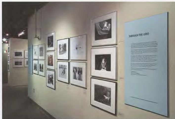
Through the Lens 2013 on display at the Canmore Museum

With the cooperation of the Alpine Club of Canada, a reproduction of this book is currently on display in our Gateway to the Rockies exhibit. We will be publishing a hard cover version of The Animals' Alpine Club for all to enjoy in time for Christmas 2013. For purchase details please contact The Whyte Museum Shop at 403-762-2291 extension 340, or shop@whyte.org