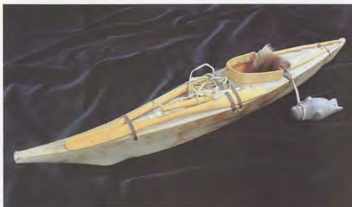
Peter Saunders, Kayak , ca. 1940, Caribou skin, bone and sinew, balsam wood and soap stone, 61 x 6.4 x 9 cm, Whyte Museum of the Canadian Rockies