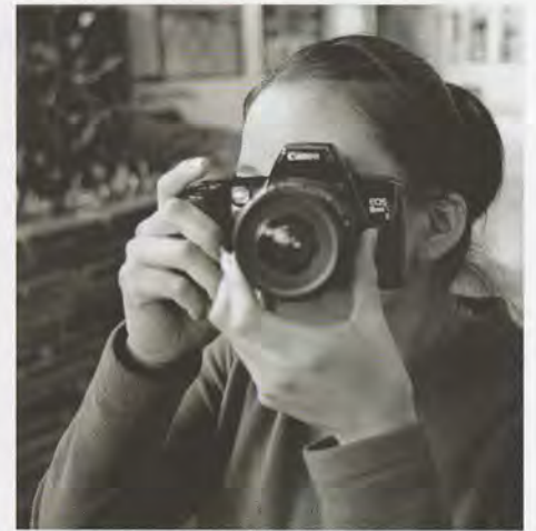
Through the Lens participant (detail), 2000, Whyte Museum of the Canadian Rockies

The exhibitions The Photographers of Scotia Waterous , Sarah Fuller: My Banff and Through the Lens are part of EXPOSURE 2014, THE CALGARY BANFF CANMORE PHOTOGRAPHY FESTIVAL.