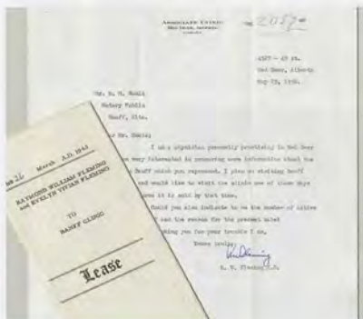
Correspondence and lease agreement relating to the sale of the Banff Clinic, accn. 8237, Whyte Museum of the Canadian Rockies